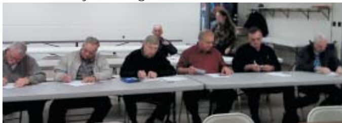
Noble County Town Hall Meeting

shared their thoughts and ideas on a variety of topics and shared suggestions for possible partnerships and solutions. Perspectives shared will help Buckeye Hills learn how to best serve residents of the 8-county region. County-by-county reports are available at www.buckeyehills.org .