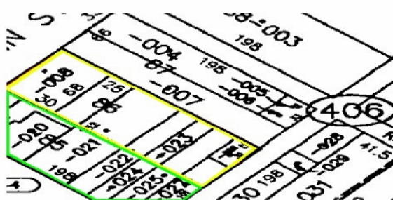
Lot Number 85 Green Color Boundary Lot Number 86 Yellow Color Boundary