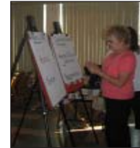
Noble County Town Hall Meeting

Town Hall meeting participants voiced their thoughts on a variety of topics and shared ideas for partnerships and working toward solutions. As a result, the true voice of those living