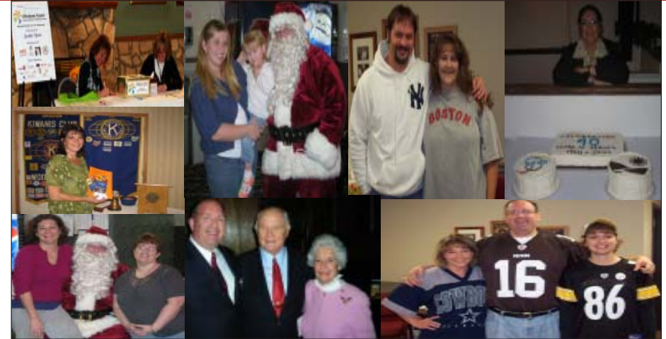
Development and AAA8 staff at work and having fun.